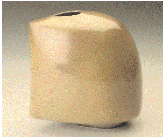
2005. Salt-glazed stoneware. 26 cm/h.

before moving off again swiftly – “like a skateboarder at the top of the wall”. Within this description there is a sense of suppressed amusement and a gentle nod towards the spontaneous pen of the animator. In making these forms King tries to use as few gestures as possible – akin to something either drawn or quickly modelled; a drawing that succeeds with the least possible lines.