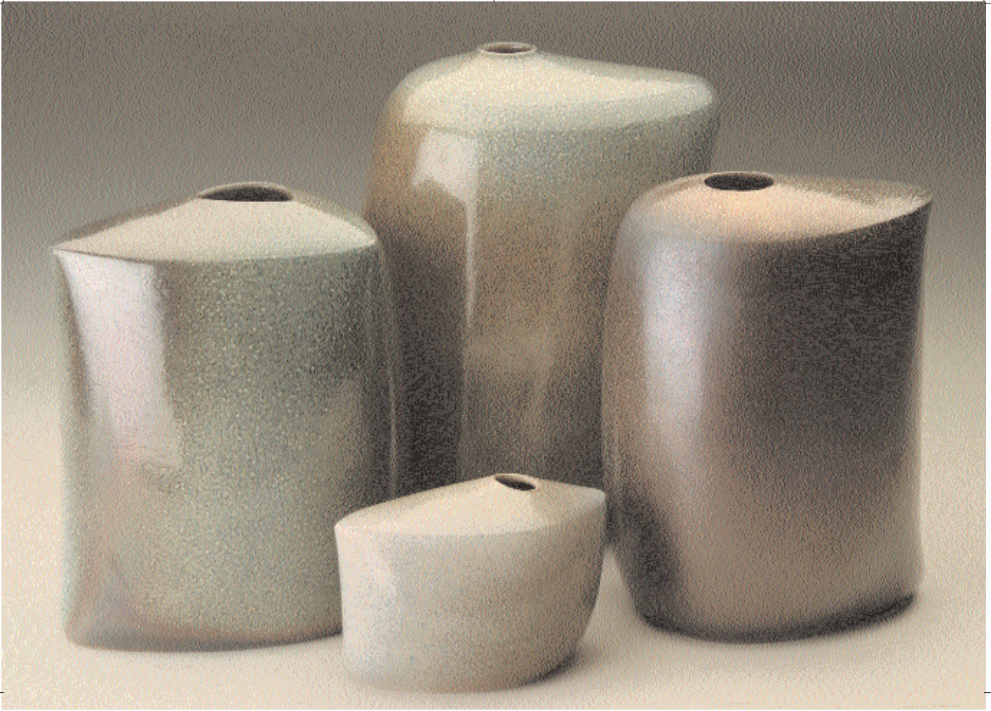
Group of four. 2005. Salt-glazed stoneware. Tallest 32 cm/h.